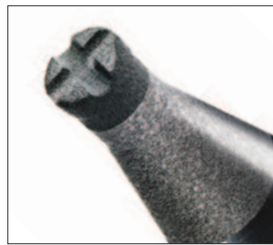
刀刃形状 4刃 Cutting edge shape 4-Flute