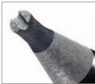
刀刃形状 2刃 Cutting edge shape 2-Flute