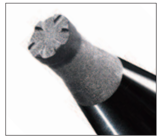
刀刃形状 6刃 Cutting edge shape 6-Flute